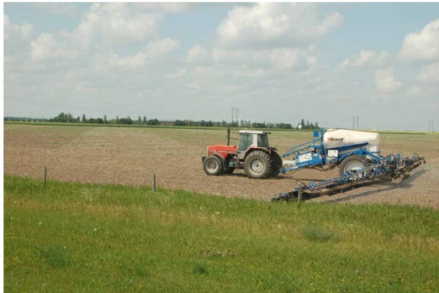
Figure 3. Pre-seed application of glyphosate forms the basis of modern direct-seeding systems which have revolutionized crop production in western Canada.

Glyphosate, the only herbicide in this group, (Roundup® and many others) is a non-selective, non-residual, highly translocated herbicide that is effective on a wide range of grass and broadleaved weeds. It was introduced in western Canada in 1976, primarily as a product used at high rates in summerfallow and after harvest for control of perennial weeds such as quackgrass ( Elymus repens (L.) Gould) and Canada thistle. Initially, it was expensive ($65 to $130 per hectare) and its use was limited mainly to fields that had literally been overrun with perennial weeds. Subsequent research and development resulted in the registration of lower rates for controlling annual and winter annual weeds prior to crop emergence and to pre-harvest and post-harvest applications for perennial weed control. These use patterns, combined with a significant price reduction facilitated the development of direct-seeding technology which is now the dominant production system on the prairies (Figure 3). The mid -'90s saw the introduction of Roundup Ready® canola cultivars which have been widely adopted and now account for over 40% of the canola acreage in western Canada. Because glyphosate is the only herbicide in this MOA group, it is critical to the continuing success of our current no-till production systems of crop management. Thus, the possible appearance of resistant weed biotypes is a constant concern.