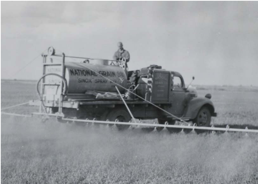
Figure 1. Applying Sinox® in west-central Saskatchewan for selective broadleaf weed control, 1948..