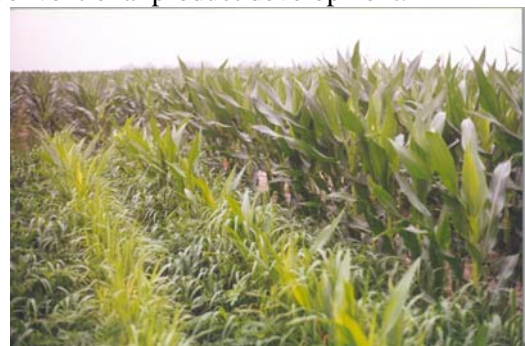
Figure 2: Weed control in corn. Left: untreated. Right: Pre-emergence treatment with metolachlor. Grasses compete with corn for light, water and nutrients. Corn in untreated plot heavily affected.