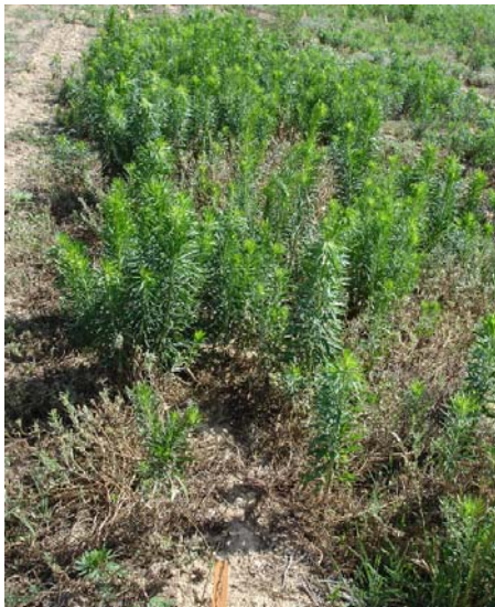
Figure 3: Glyphosate resistant horseweed treated with 1.3 kg/ha glyphosate.

If we want to reduce the development of difficult-to-control weed populations, we will have to alternate the use of herbicides with different modes of action and to combine glyphosate with residual herbicides (Figure 3). The addition of different herbicide mixtures in most HT crops could be used to control such weed populations. The decrease in the number of new selective soybean herbicides and the dominant position of glyphosate will cause concerns about the availability of alternative herbicide solutions in the future for this crop 5,12 . New soybean varieties with stacked glyphosate and dicamba tolerance traits are in development which will allow in-crop control of some important glyphosate-resistant weeds. However, glyphosate will only maintain its current status as an efficient weed control herbicide if it is integrated in a herbicide rotation program.