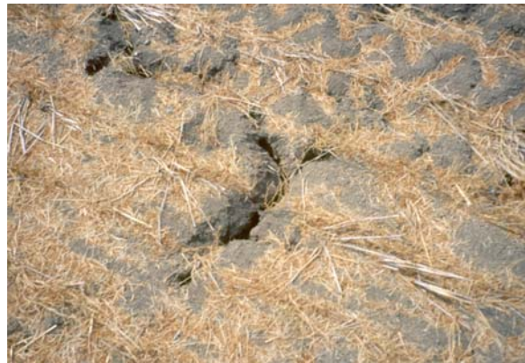
Figure 1. Wide cracks in a Vertisol soil of the Sceptre Association, in late August after a warm, dry summer. The now-harvested crop was lentil on chem-fallow.