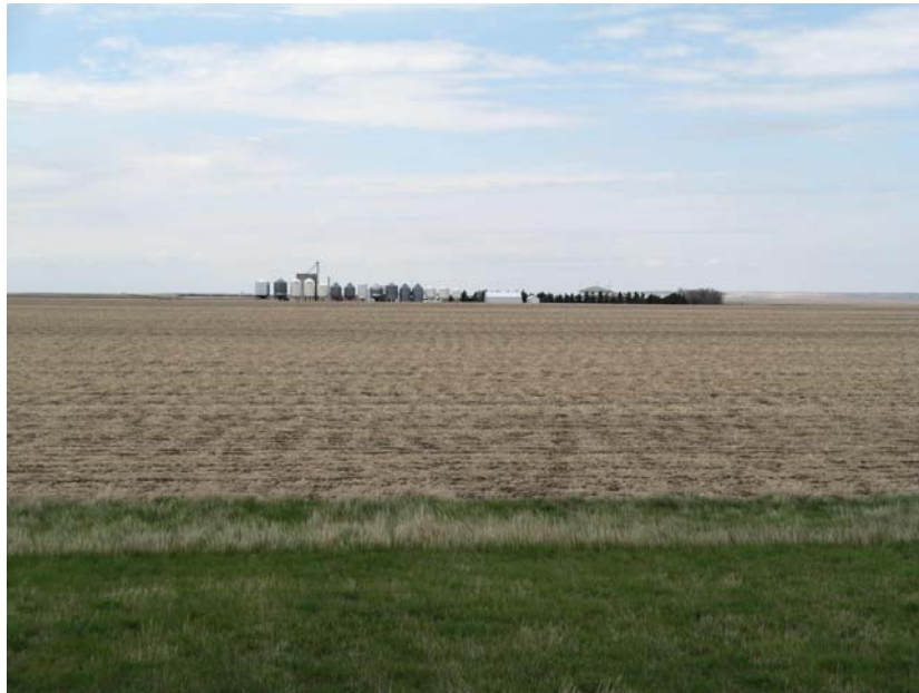
Figure 6. The level landscape of the glaciolacustrine Eston Plain, with clayey soils of the Sceptre Association. The photograph was taken in early spring, illustrating the cover of crop residues that protects the soil from wind erosion.

Sceptre soils occur in other glaciolacustrine plains, in lands not as extensive as those described above. This includes lands near Assiniboia and Gravelbourg in southwestern Saskatchewan, and many areas of a few to perhaps 10 or 20 square kilometres here and there throughout the Brown soil zone.