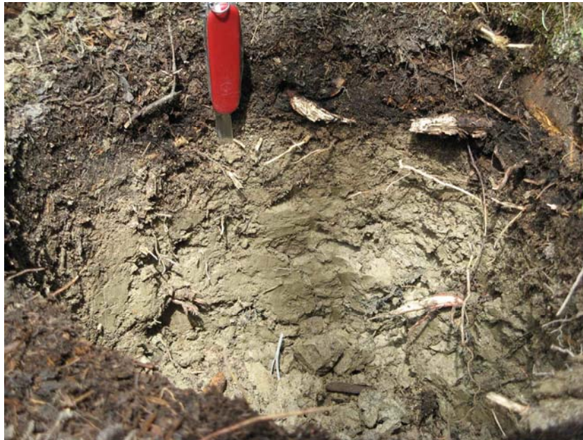
Figure 5 Vertic Gray Luvisol soil under Boreal Forest near Flin Flon, Manitoba. The profile includes a thick surface organic horizon (LFH), a thin, gray Ae horizon, and a clayey Btss horizon. The glossy surfaces or slickensides are visible at about 30 cm depth, just below the large cut-off tree root.