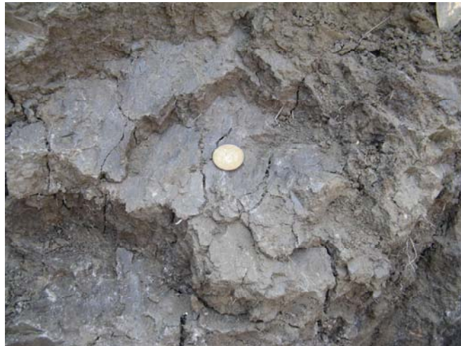
Figure 3. Slickenslides in the C kss horizon a Vertisol soil of the Sceptre Association. The glossy pressure faces result from one block of soil sliding by another as the expanding subsoil wets up unevenly. The whitish flecks are gypsum salts, common at about 0.5 to 1 m depth in Sceptre soils. The ‘loonie’ coin provides scale.

Slickenslides are shear surfaces with a shiny or glossy appearance that form when one soil mass slips by another as the subsoil re-wets unevenly (Figures 3). Slickenslides have unidirectional grooves parallel to the direction of movement, and usually occur at an angle of 20 to 60 degrees to the surface. Slickenslides often intersect, resulting in the formation of wedge-shaped aggregates that often occur in Vertisolic soils. Horizons with slickenslides are designated with the letters “ss”, as in Bss or C ss .