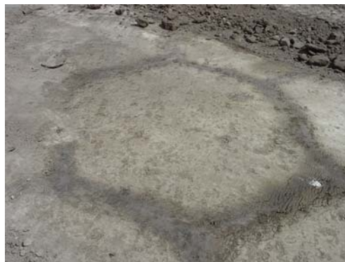
Figure 7. The photograph was taken by an unidentified engineer working on a new subdivision in Saskatoon. It illustrates the polygonal pattern of dark, organic matter-enriched topsoil that has fallen down cracks in a Vertisolic soil, probably at a depth of 50 to 80 cm, and exposed as surface soil was excavated. The photo also indicates the need for special practices to deal with the swelling clays, and possible future problems with streets, sidewalks and basements.

The amount and mineralogy of the clay in Vertisolic soils often results in problems when soils are used to support structures or roads. The high shrink-swell potential and low bearing capacity, especially when wet, are the main reasons for failures of engineering works, requiring that special practices be adopted 3 . There are difficulties with foundations, streets, sidewalks and highways. Travelling Highways 1 and 75 across the Red River Valley brings to mind both a solution to the problem of heavy clay soils, and a reminder of their shrink-swell properties. The highways are constructed with 10- or 15-m long sections of concrete, rather than continuous asphalt, because of the low bearing capacity of the soil. Adjacent sections all seem to have a centimetre or so difference in elevation, and the tires thump over each joint, a constant reminder of the shrink-swell nature of the smectite clays. There is little doubt that Vertisolic soils present special problems to those building on them, and soil-specific solutions are required.