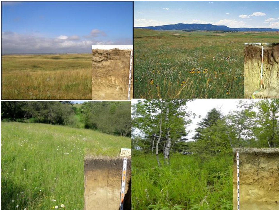
Figure 2 Landscapes with natural vegetation and related soils of (from upper left), the Brown, Dark Brown, Black and Dark Gray soil zones of the Prairies.

the broadest level of taxonomy, namely, the Order level. The Chernozemic Order is further divided into “Great Groups” that include the Brown Chernozem soils, Dark Brown Chernozem soils, Black Chernozem soils and Dark Gray Chernozem soils (Figure 2).