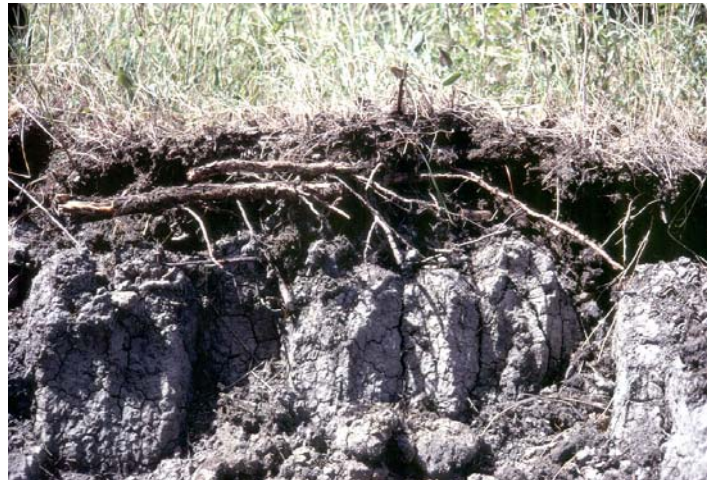
Figure 2 A Vertic Solonetz on clayey glaciolacustrine parent material at the base of the Pasquia Hills in Saskatchewan. Note the concentration of tree roots in the Ahe horizon, and the columnar structure of the Bnt. Slickensides occur at about 1 m depth.

Na to form a true Solonetz. Only a few of the Solod profiles had Ca/Na ratios <10, despite a strong expression of a Bnt morphologically. This too is consistent with a stronger influence of Na in the past 8 , or occasional years when higher water tables induce solonization today. The complete or nearly correspondence between morphology and chemistry for the Solodized-Solonetz and Solonetz profiles are consistent with an ongoing role of Na in their formation.