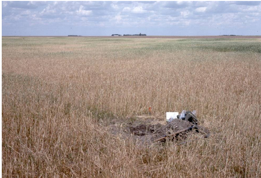
Figure 3 Variable crop stands on Solonetzic soils in the Weyburn area. The poor stands are mainly on Solodized-Solonetz soils, the taller and greener stands on deep Solods or Solonetzic Dark Brown Chernozems.

Deep plowing (60 cm depth) or deep-ripping to disrupt the Bnt horizons and bring calcium salts (namely gypsum, calcium sulphate which is much more soluble than carbonate) to the surface has been used to improve Solonetzic soils. The calcium is to exchange with Na ions adsorbed to clay in the Bnt material, and improve soil structure. Breaking up the clay-pan or Bnt improves water transmission and fosters deeper rooting. Deep ploughing increased wheat yields by 0.34 to 0.40 tonnes per hectare in a trial on two fields west of Weyburn on Trossachs soil 5 . Deep ploughing is time-consuming and expensive because of high energy costs, and has not been adopted generally.